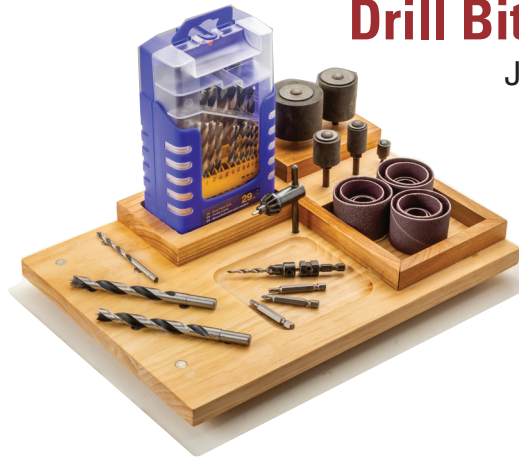
Drill Bit Organizer (Top View)

This simple organizer, that can be customized to suit your needs, will save time and keep your drill bits from going astray.